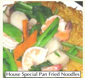
House Special Pan Fried Noodles