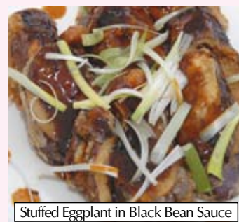
Stuffed Eggplant in Black Bean Sauce