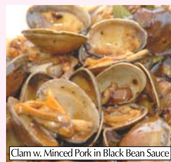
Clam w. Minced Pork in Black Bean Sauce