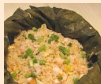
Lotus Leaf Seafood Fried Rice