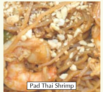
Pad Thai Shrimp