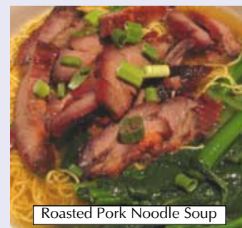
Roasted Pork Noodle Soup