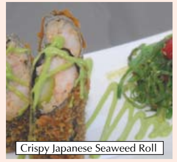
Crispy Japanese Seaweed Roll

Steamed Shanghai Juicy Buns (8) 6.50 Steamed Chinese Greens w. Oyster Sauce 6.00 Crispy Coconut Shrimp with Mango Sauce (4) 6.00 Crispy Flounder Fillet w. Honey Coated Walnut 7.00 Sliced Roasted Pork 7.00 Lemon Grass Grilled Chicken 7.00 Hong Kong Roasted Duck (1/4) 8.00 Seared Ahi Tuna 8.50 Crispy Japanese Seaweed Roll 7.50 Crispy Garlic Chicken Wings (5) 5.00 Crispy Calamari Rings in Five Spice Flavor 7.00 Sliced Five Spice Beef (Cold) 6.00 Steamed Char Sui Bao (3) 5.00 Crispy Soft Shell Crab Salad 10.00 Korean Pancake - Vegetarian 6.50 Roasted Duck & Roasted Pork Combo 12.00