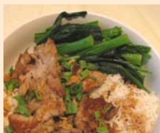
Lemon Grass Grilled Chicken w. Veg.