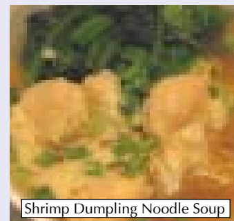
Shrimp Dumpling Noodle Soup