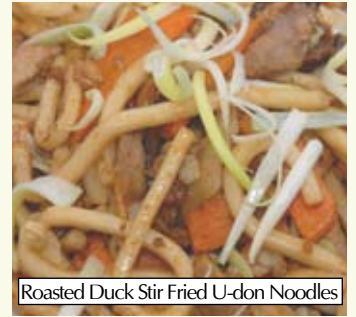
Roasted Duck Stir Fried U-don Noodles