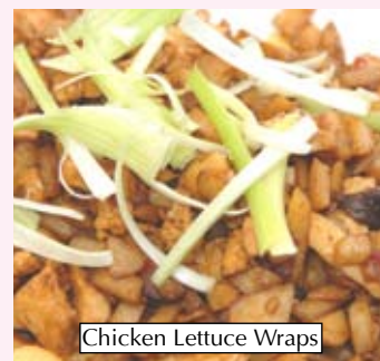
Chicken Lettuce Wraps