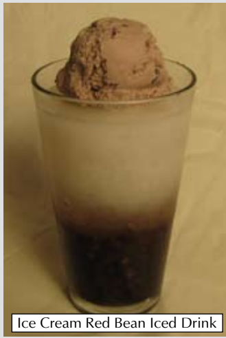
Ice Cream Red Bean Iced Drink