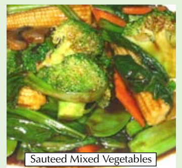
Sauteed Mixed Vegetables