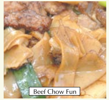
Beef Chow Fun