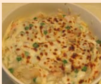
Baked Seafood Fried Rice w. Cheese

Price Subject to Change without Notice Party of 6 or More, 18% Gratuity will be Applied