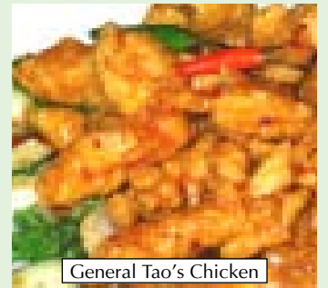
General Tao's Chicken