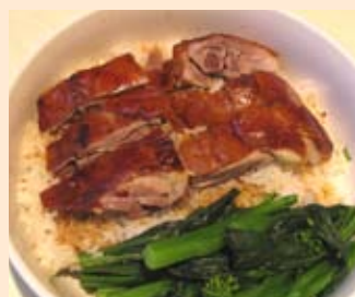
Roasted Duck w. Veg.