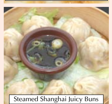
Steamed Shanghai Juicy Buns