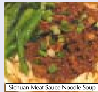
Sichuan Meat Sauce Noodle Soup