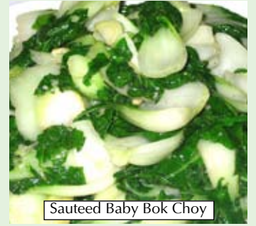
Sauteed Baby Bok Choy