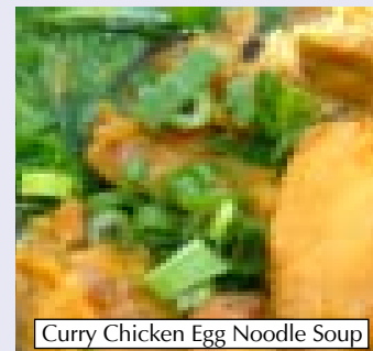
Curry Chicken Egg Noodle Soup