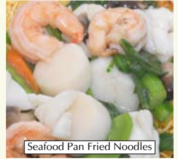
Seafood Pan Fried Noodles