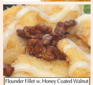
Flounder Fillet w. Honey Coated Walnut