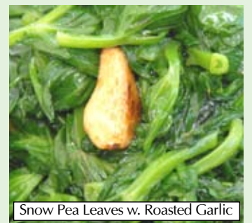
Snow Pea Leaves w. Roasted Garlic