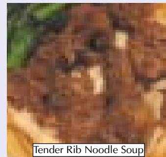
Tender Rib Noodle Soup