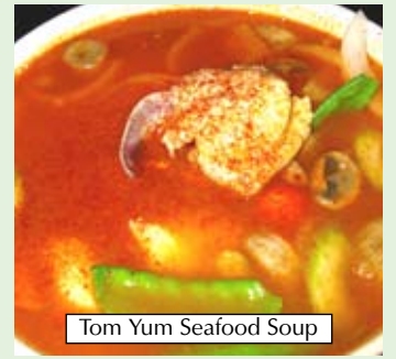
Tom Yum Seafood Soup