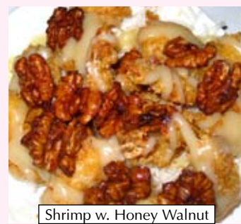
Shrimp w. Honey Walnut